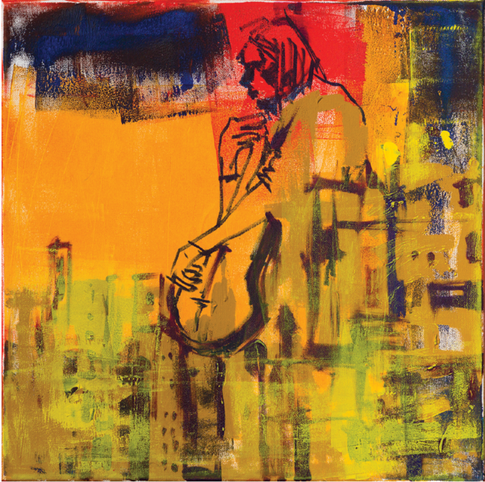
Washington Square Park