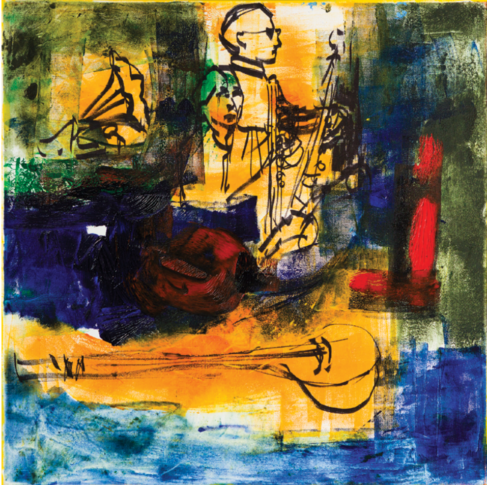
Multiculturalism in Manhattan