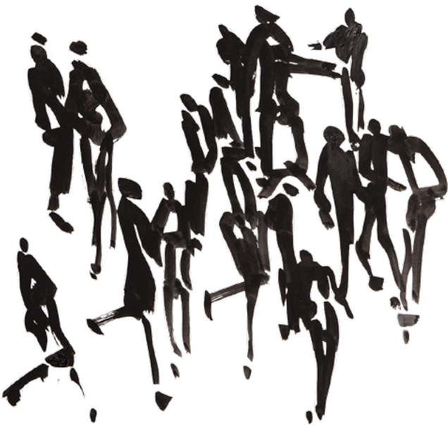
Image Titles :