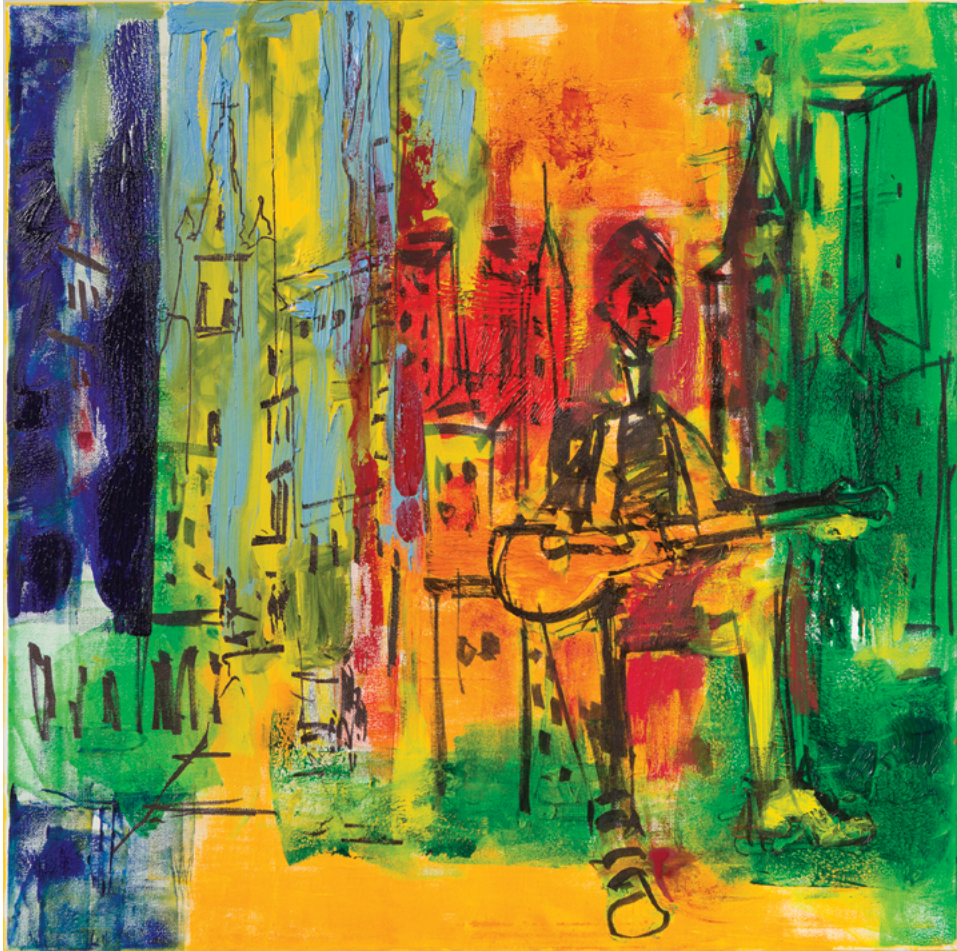
Jazz, Harlem New York