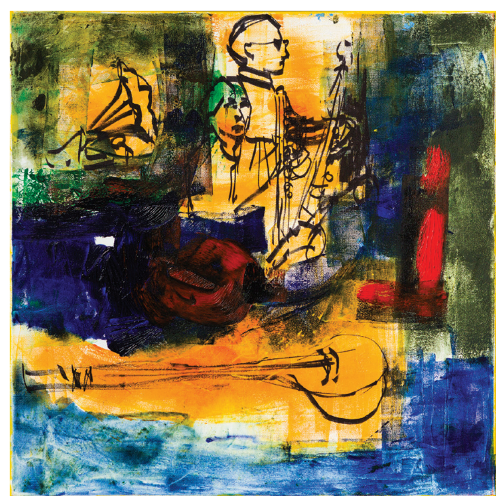
Multiculturalism\ in\ Manhattan