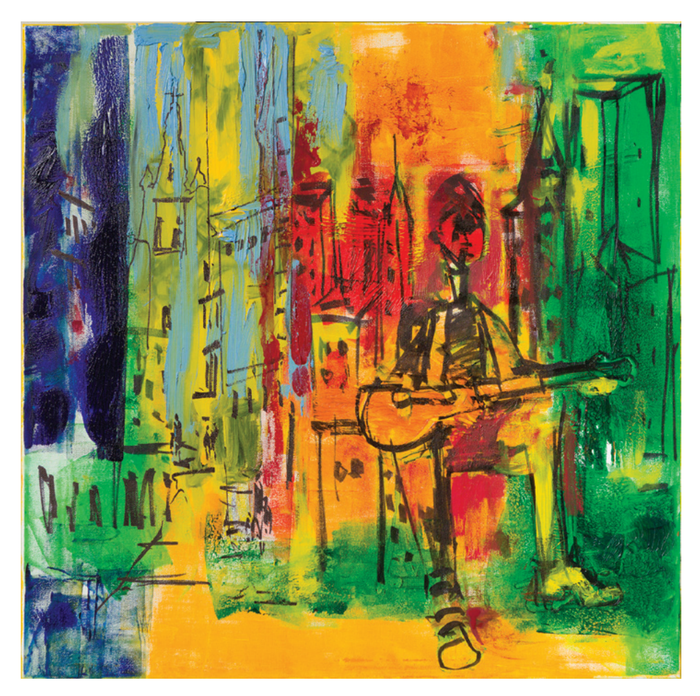
Jazz, Harlem New York