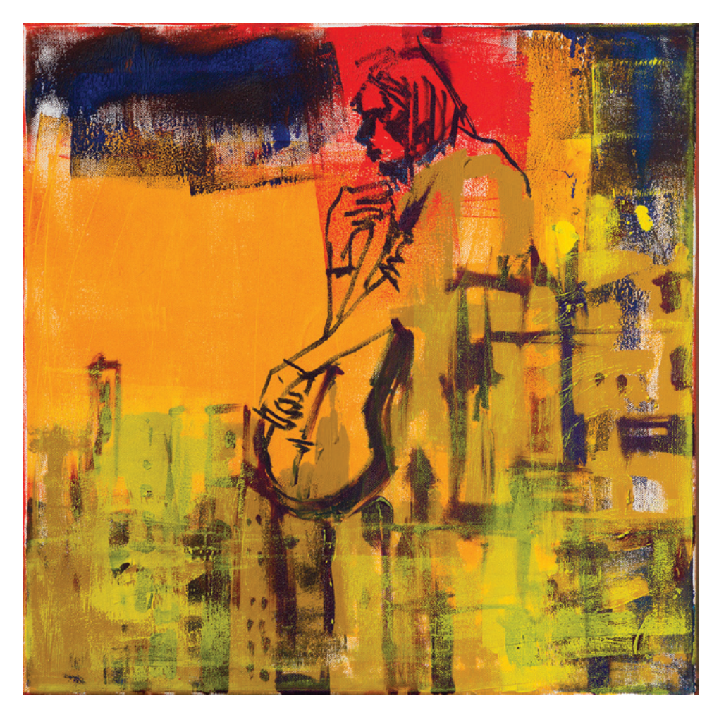
Washington Square Park